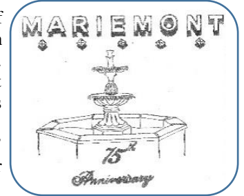
Rough Draft of the Official 75 th Anniversary Logo